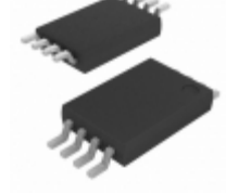
AT25640B-XHL-T Micrel / Microchip Technology IC EEPROM 64KBIT 20MHZ 8TSSOP