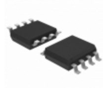
AT25640N-10SC-2.7 Micrel / Microchip Technology IC EEPROM 64KBIT 3MHZ 8SOIC