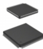
PI7C8150BMAIE Diodes Incorporated IC PCI-PCI BRIDGE ASYNC 208- FQFP