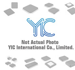
PI7C8150BMA PERCICOM PI7C8150BMA PERCICOM