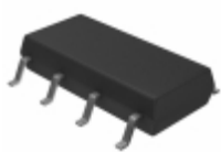
G3VM-402J Omron Electronics Inc-EMC Div RELAY SSR DPST 400V 120MA 8SOP