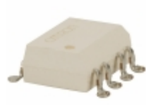
G3VM-402F Omron Electronics Inc-EMC Div RELAY SSR DPST 400VAC 120MA 8SMT