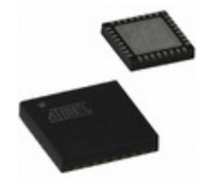
AT97SC3205T-G3M4600B Microchip Technology PRODF COM I2C TPM 4X4 32VQFN